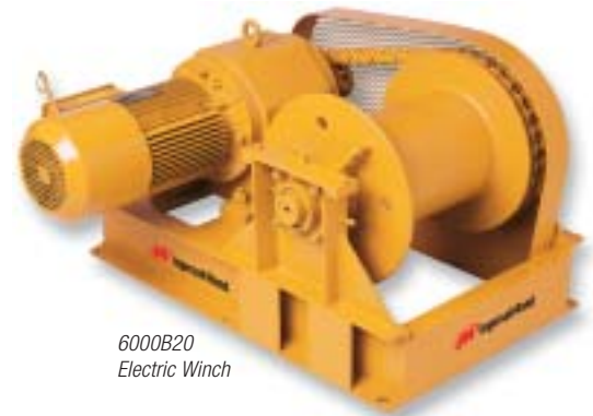
6000B20 Electric Winch