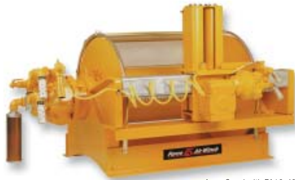
Accu-Spool with FA10-40